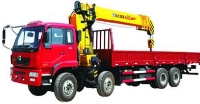
*)Truck Mounted Crane

First, let me define a “Crane” Generally speaking, A crane is a type of machine generally equipped with a hoist rope , wire ropes or chains , and sheaves , that can be used both to lift and lower materials and to move them horizontally. It is mainly used for lifting heavy things and transporting them to other places A confined space has a restricted entrance or exit due to location, size or means. Following are the major types of cranes.