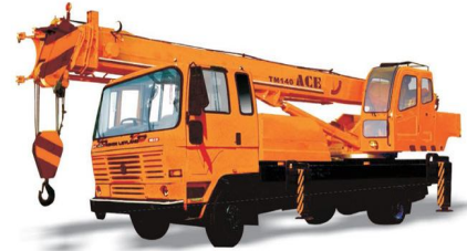
*) Hydraulic Crane